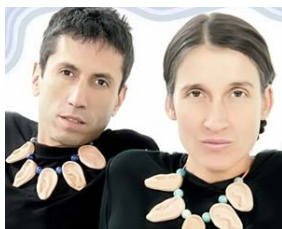
Concert: Aterciopelados Venue: MUSAC Date: 26 June 2010

In the second semester of 2010, in the framework of celebrations for MUSAC's 5th Anniversary, the Museum is keen to promote a greater awareness of new initiatives in music coming out of Latin America, all of which share experimentation as their main approach, regardless of their chosen style. The programme will include performances by Aterciopelados (Colombia) and others.